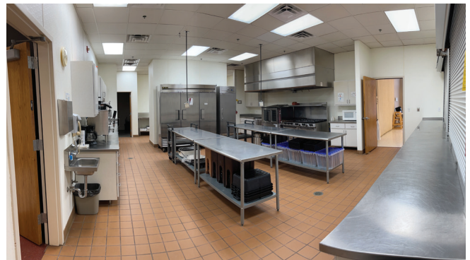
Commercial Style Kitchen