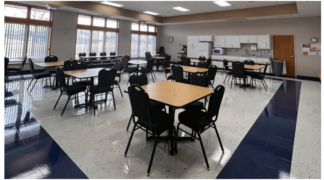
Multi-Purpose Room - Square Tables