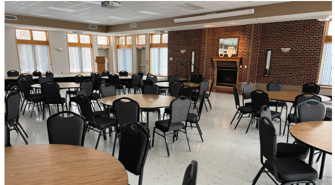
Fireside Room - Round Tables