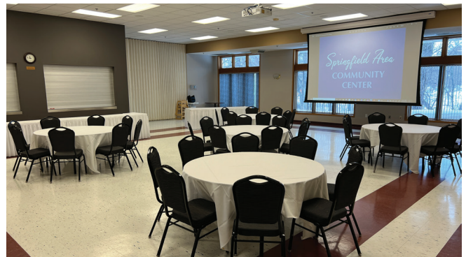
Parkview Room - Round Tables