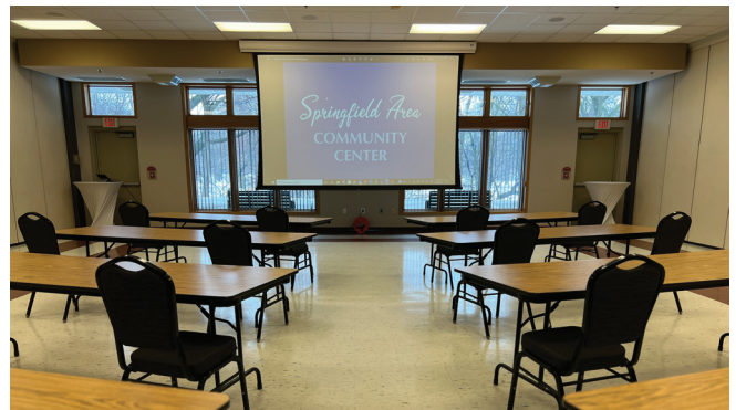
Garden Room - Rectangle Tables