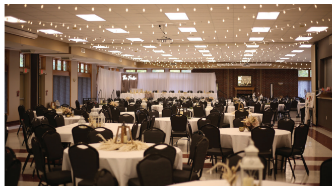
Complete Community Center